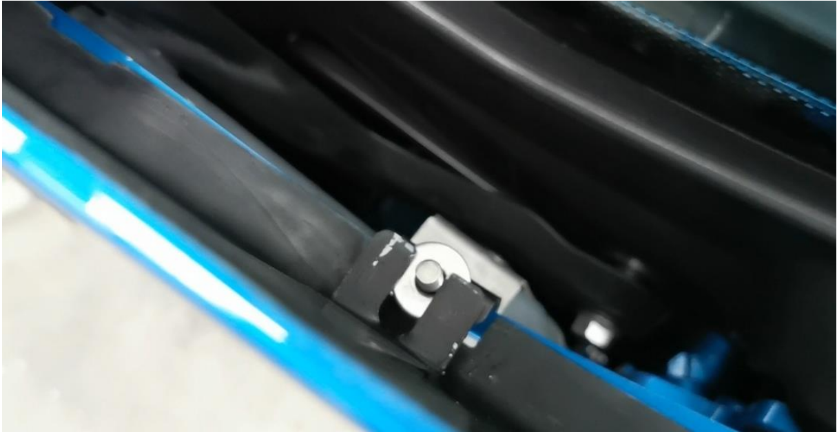
BRACKET POSITION 3 ( MIDDLE BRACKET )