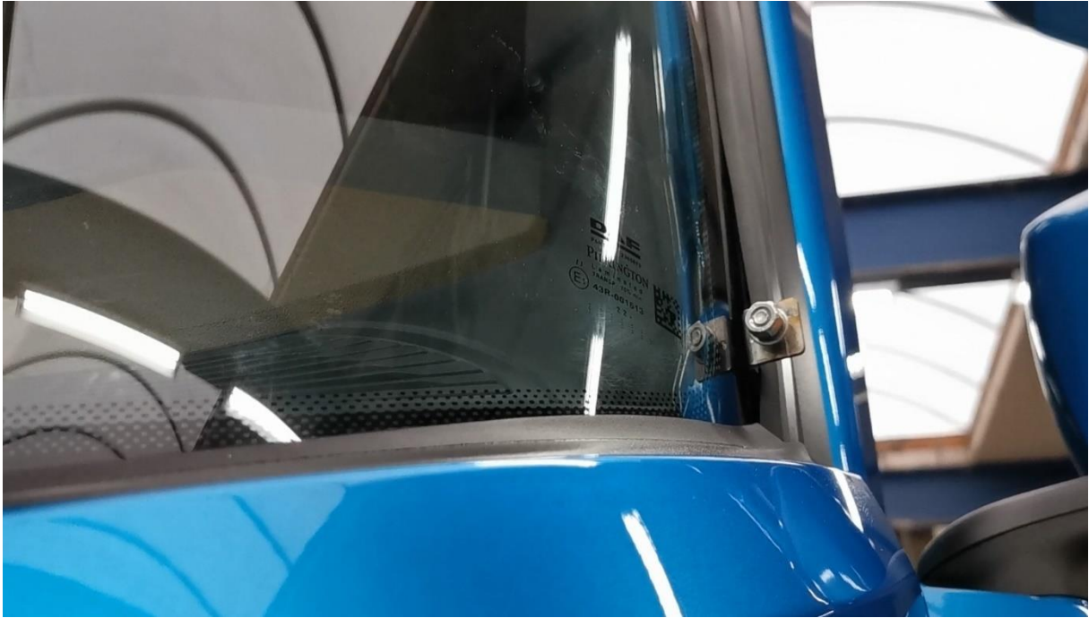
BRACKET POSITION 1 AND 5.