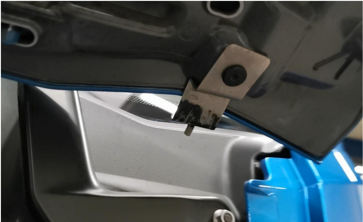
BRACKET POSITION 2 AND 4 ( INSIDE VIEW )