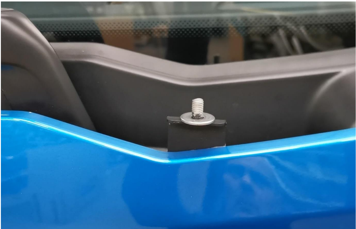
BRACKET POSITION 2 AND 4 ( OUTSIDE VIEW )