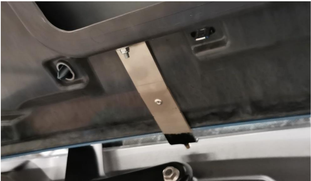
BRACKET POSITION 3 ( MIDDLE BRACKET INSIDE VIEW ) FIX WITH A NUT AND BOLT AND POP RIVET AS SHOWN.